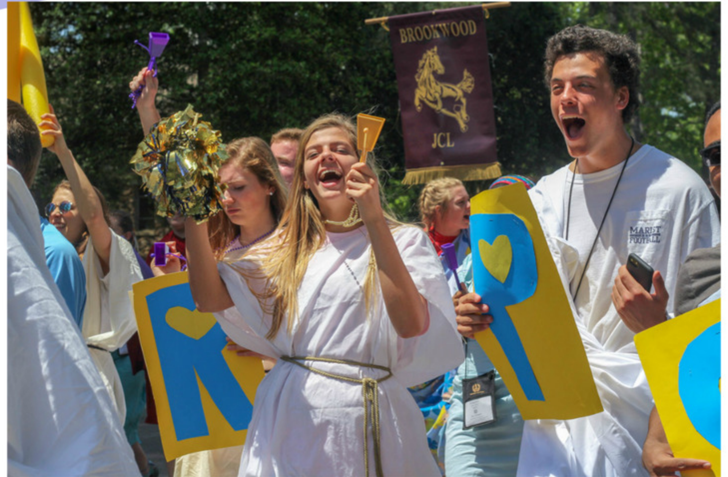
Students from all different chapters cheer loudly while marching in the Roman procession.

Later that night, majority of the teachers and students gathered at the auditorium to watch That's Entertainment where the wide range of acts impressed everyone. From dancing to stool percussion, the acts filled