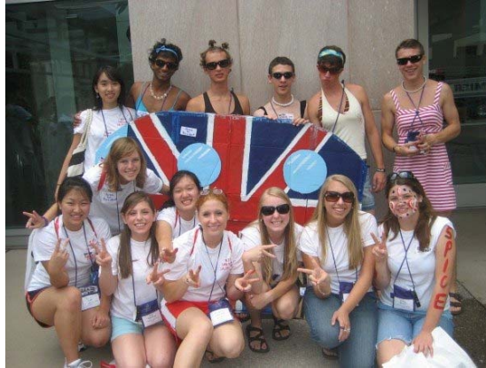
The spice girls and their adoring fans outside of General Assembly

The National convention this year was one of the best for Georgia ever! Held at the University of Tennessee during the last week of August, the 114 GJCL delegates boarded our two charter buses for the journey to Knoxville. Taking a break at Dollywood to enjoy the three roller coasters and endless redneck fun, we finally arrived at UT. The GJCL made a strong showing in many events, winning first in both Ultimate Frisbee (second year in a row!) and Ludi Soccer. In academic